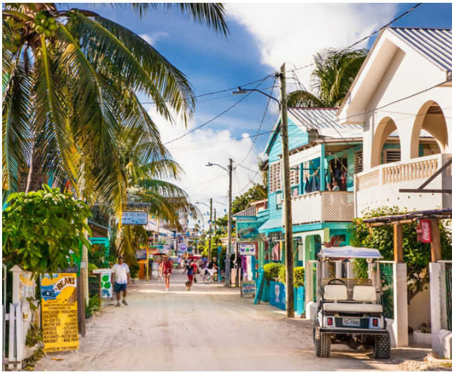
Tourist photo of Belize City, Belize