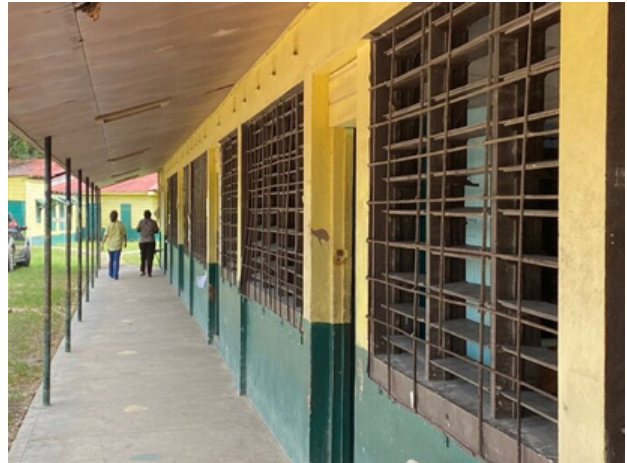
Our Lady of the Way school in Belize

Belize is a beautiful coastal country in Central America characterized by its lovely beaches, colorful buildings, and cheerful people. Sadly, it is also characterized by its poverty. Parents struggle desperately to provide for all of their children's basic needs, meaning they have to pick and choose which of their needs are the most important.