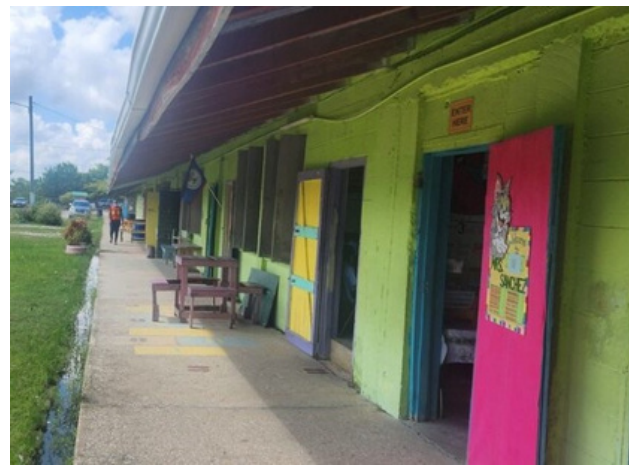
Our Lady of the Way school in Belize

For over a year, CARITAS For Children has been working tirelessly to start up a child sponsorship program in Belize, and we are happy to announce that we finally have our first children enrolled in the program and available for sponsorship.