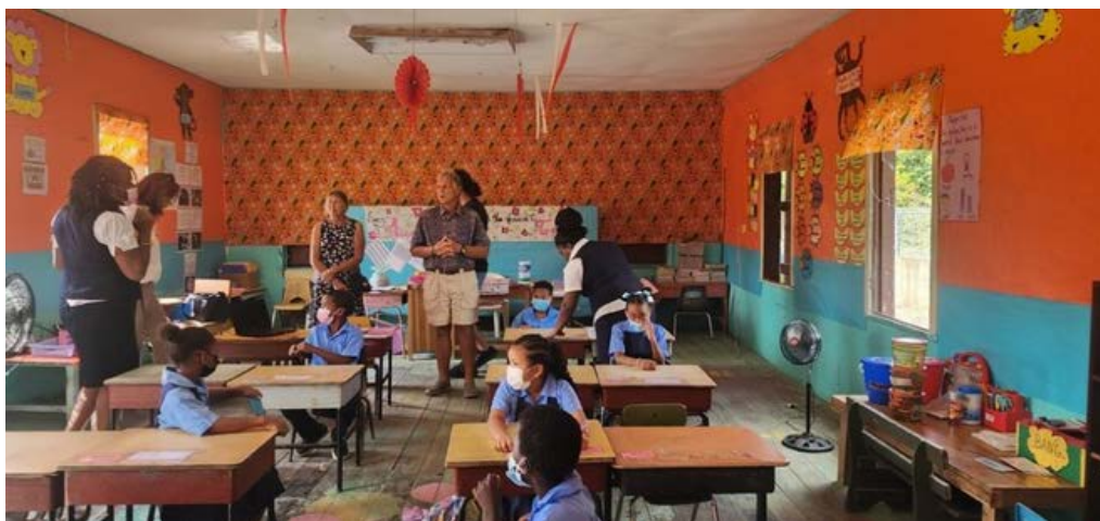
Classroom at Our Lady of the Way school in Belize

Often, the children's education takes a back seat, as food, clothing, and shelter are prioritized. These parents want nothing more than to give their children a happy and successful life, and they know that this goal cannot be achieved without a quality education. For this reason, we are very excited to welcome these children from Belize to our program, and do our best to help their families with the cost of their education.