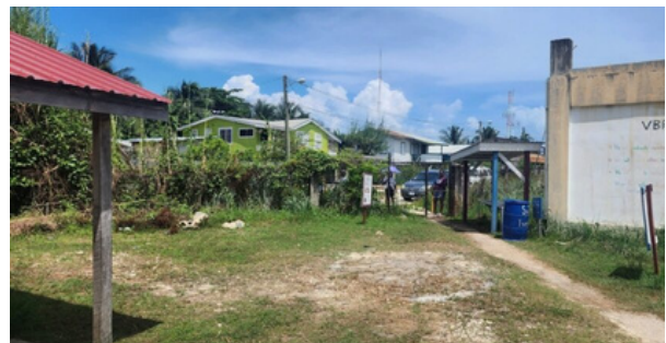
Classroom and outside St. John Vianney school in Belize

Our mission at CARITAS For Children is to spread God's love, and with your help, we can do that in Belize. If you would like to be a part of our mission in Belize, please check out our available children here and read their stories!