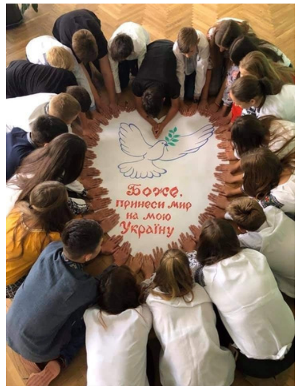
"Pray for Peace."

And please continue to keep the Sisters and the people under their care in your prayers!